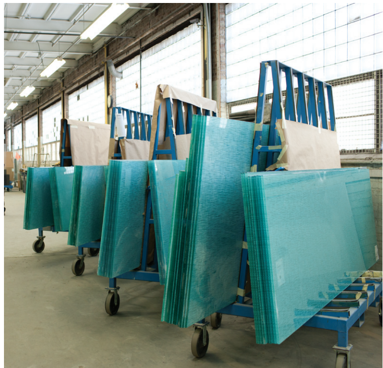
Glass for Eaton Corporation by PDR